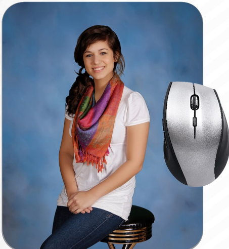
Neoprene Mouse Pad