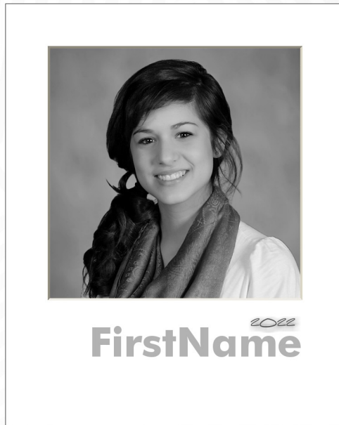
8x10 Gallery Mat