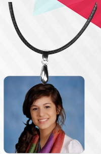
Mother of Pearl Necklace