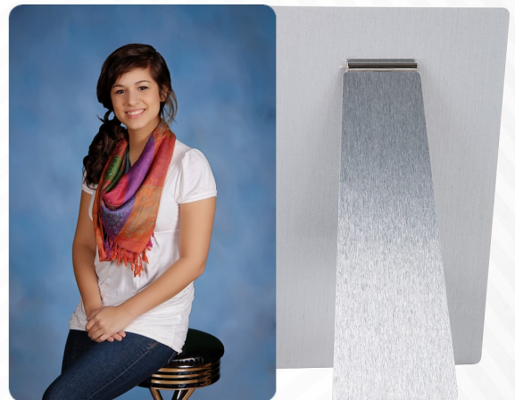
4x6 Aluminum Desk Print

**FOR A BETTER REPRESENTATION OF COLOR, VIEW THESE IMAGES ONLINE.**