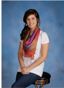
Wallet Magnets (set of 4)